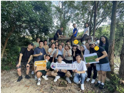
Team-building Workshop (Sep 2023)