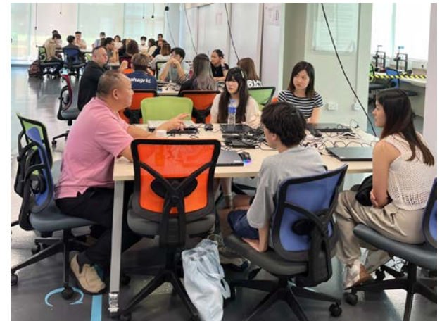
AA Meeting (Sep 2023)