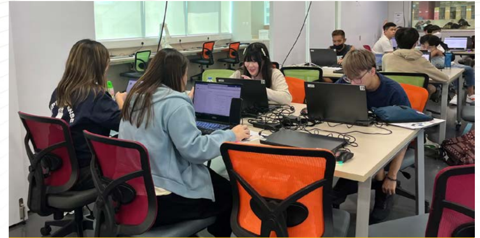
CV Preparation Workshop (Sep 2023)