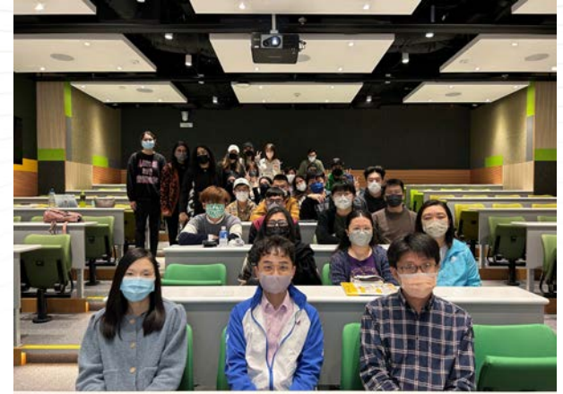
AA Get-together (Feb 2023)