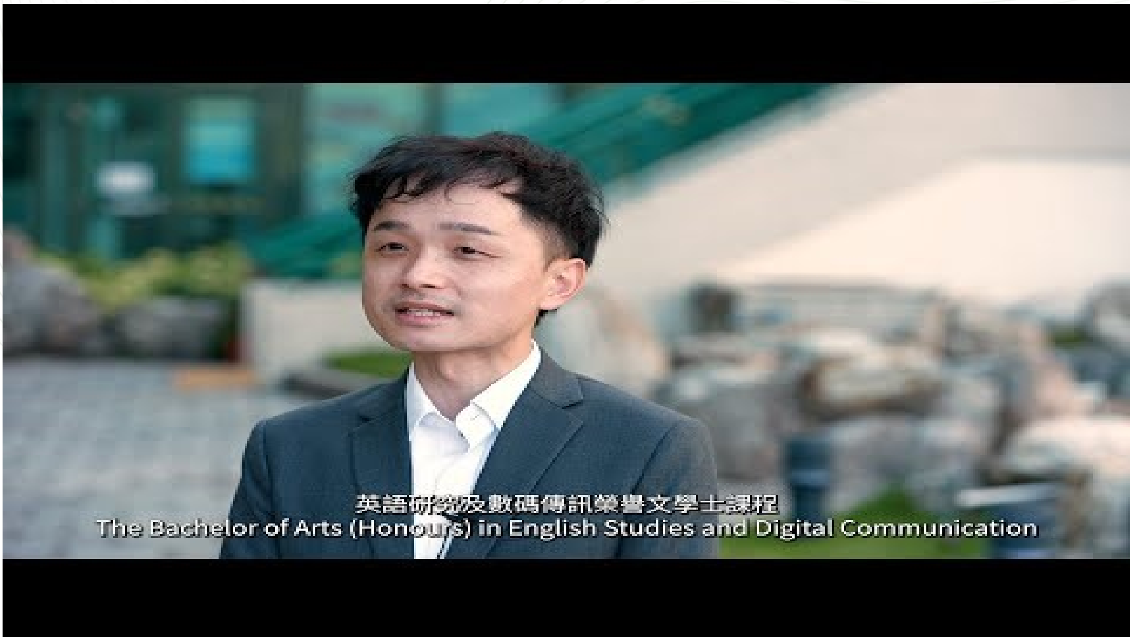
英語研究及數碼傳訊榮譽文學士課程 The Bachelor of Arts (Honours) in English Studies and Digital Communication