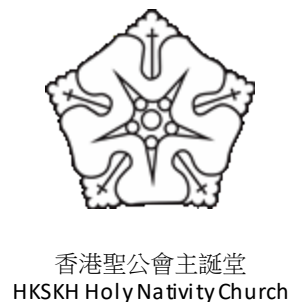
香港聖公會主誕堂 HKSKH Holy Nativity Church