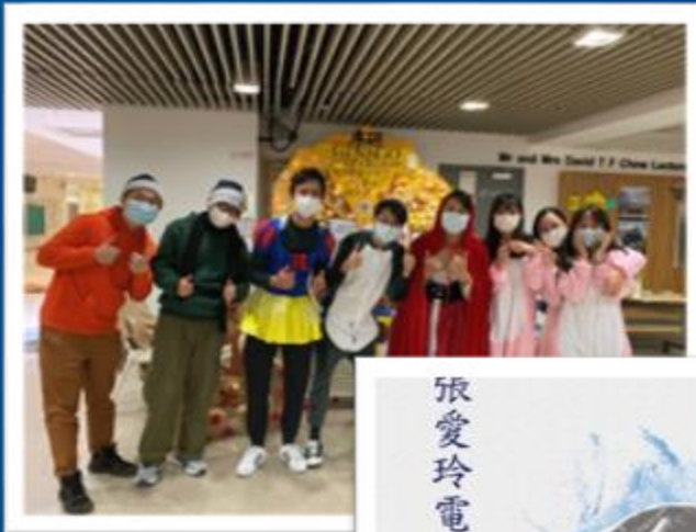
Cultural Activities hosted by Language Studies Student Association