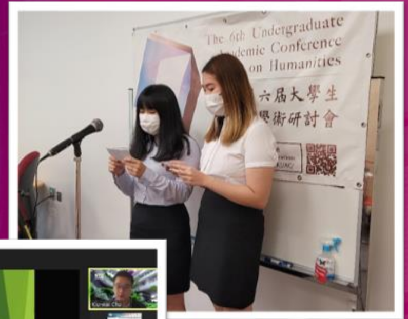
Academic Exchanges with Overseas Scholars in Undergraduate Academic Conference (UAC)