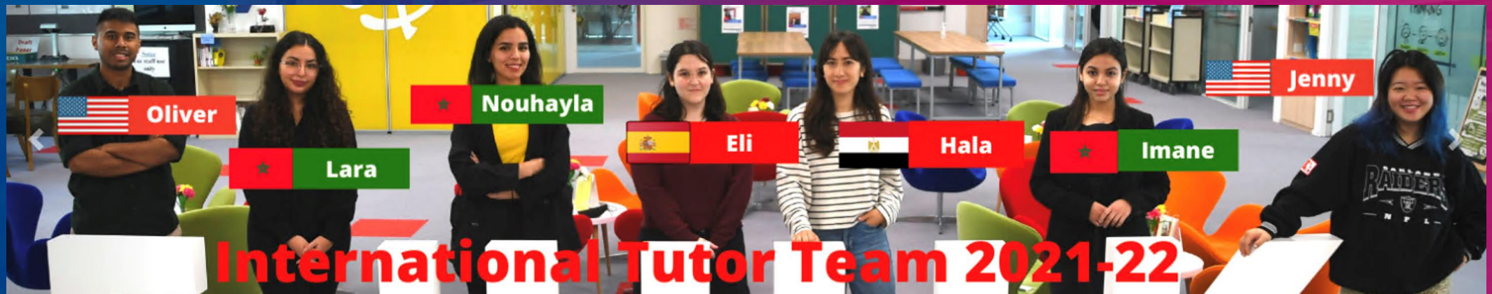
International Tutor Team 2021-22